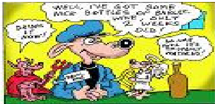
The Salty Dog