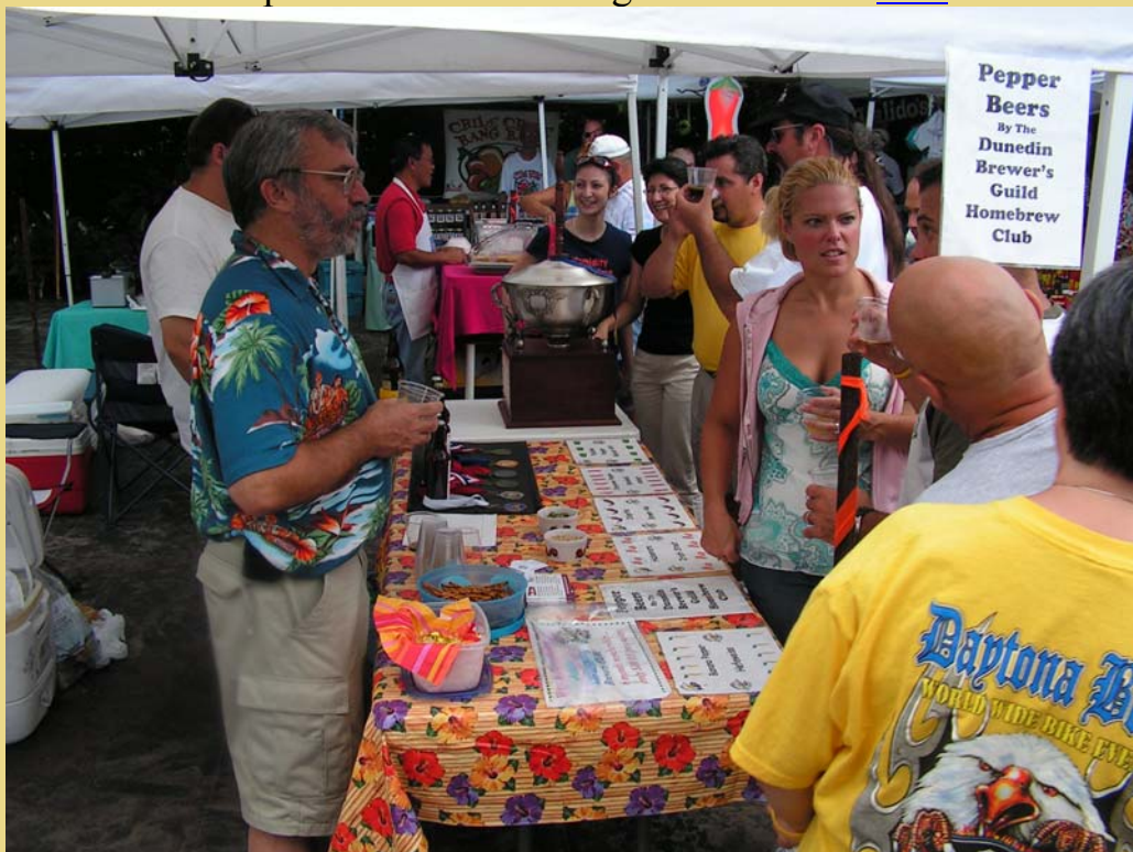
Club members entertain the crowd @ the 2005 Pepper Extravaganza