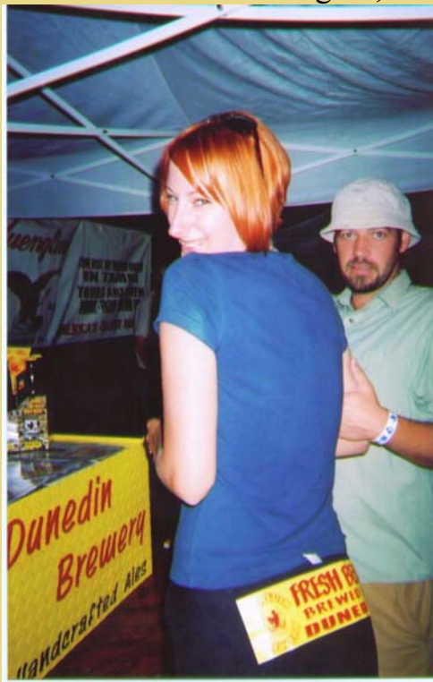
Unknown Dunedin Beer Fan @ SC05